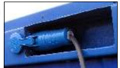
16amp connector BS4343